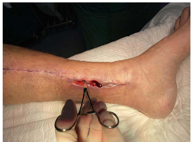
Figure 4 Day 4: Application of 1 mL of human growth factor preparation.

The patient was referred to the plastic surgeon, Dr. Vadarli (author) on December 7, 2020. Upon examination, Dr. Vadarli found an open wound (length=7.5cm and width= 0.5cm to 1.5cm) on the medial surface of the left