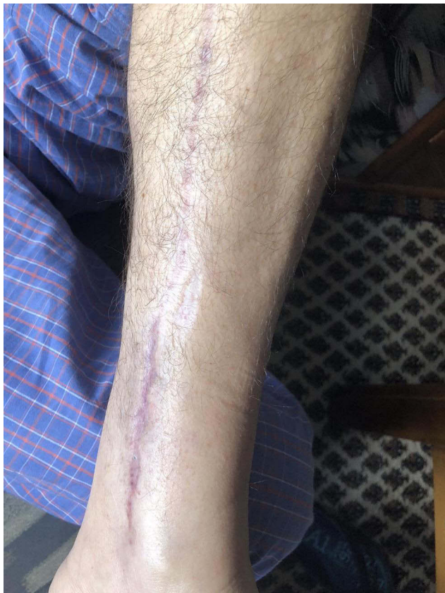
Figure 6 Three months post initiation of human growth factor treatment.

The patient had no complications, and the pain was almost negligible three days following the first application of the serum. The total amount of AQ Recovery Serum used was 15 cc (approximately four vials). Follow-up at three months showed total wound closure with only a minimal erythematous scar (Figure 6).