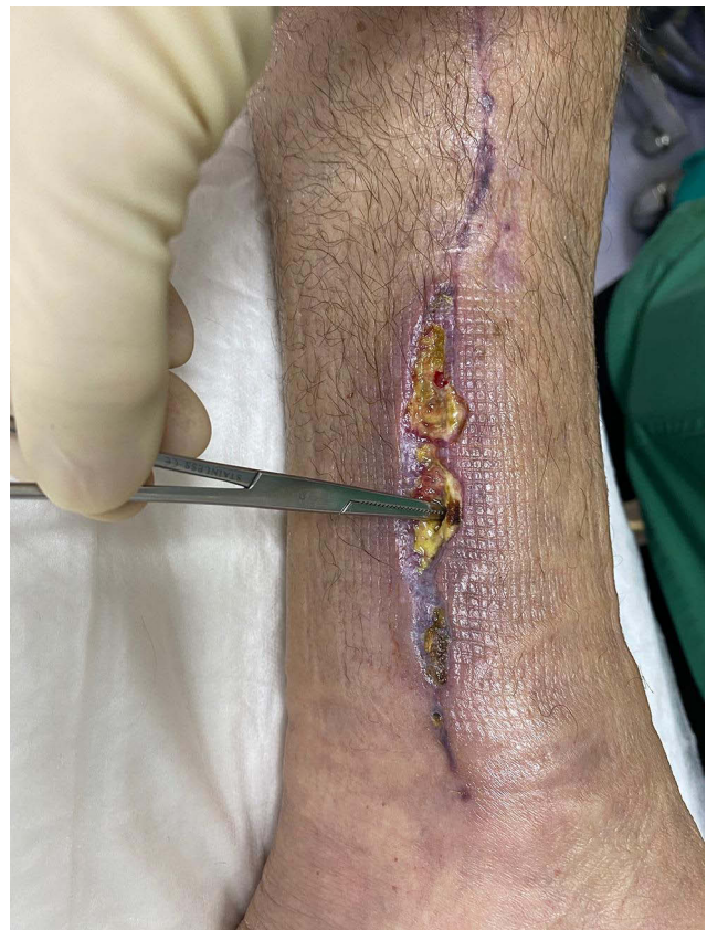
Figure 3 Day 1: Post debridement and application of 2 mL of human growth factor preparation.