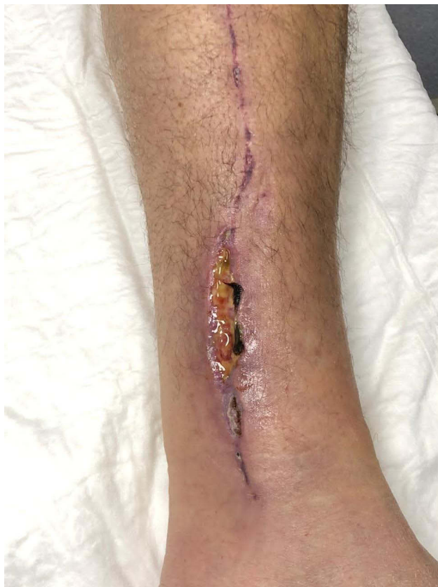
Figure 2 Day 1: Wound pre-debridement.

Despite the regular dressing changes, the wound remained open and caused him mild pain when walking; therefore, on December 6, 2020, he sent a photo of the wound to his cardiothoracic surgeon who referred him to a plastic surgeon (Figure 2).