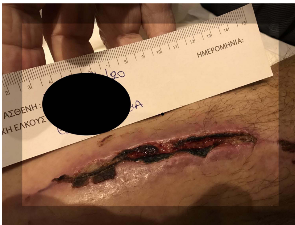
Figure 1 Wound on medial left tibia post CABG surgery.

The patient has provided the authors informed consent to publish the details of the case and all relevant images.